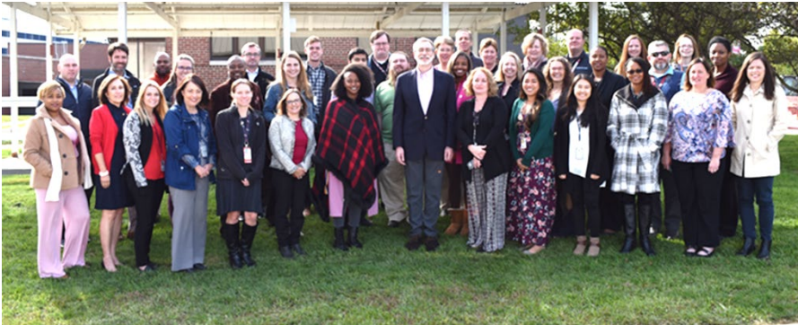
Health Services Research & Development HSR&D Staff

RICHARD L. ROUDEBUSH VA MEDICAL CENTER 1481 WEST 10TH STREET INDIANAPOLIS, IN 46202